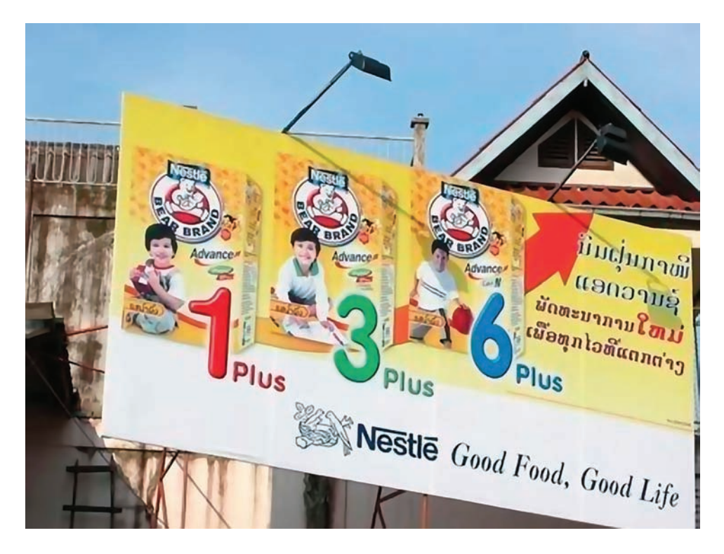
Figure 1 Billboard in central Vientiane, Laos. (Translation: Bear Brand Formula Milk; Advanced; New development; For everyone; Nestlé Brings Good Food, Good Life).

minimal effect on mortality but significant short-term and long-term effects on morbidity. Failure to breastfeed increases the risk of gastrointestinal disease, acute otitis media and acute lower respiratory tract infection in infancy.<sup>2 42</sup> In older children the rates of leukaemia are greater, as are cholesterol levels and hypertension and type 1 or type 2 diabetes.<sup>2 42 43</sup>